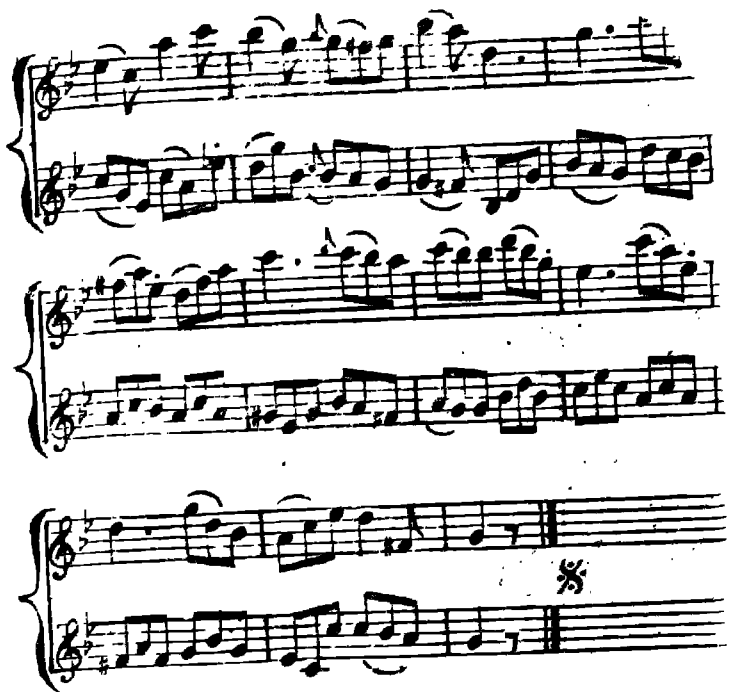
FIGURE , En avant. deux , Chassez a droite et a gauche , Traversez Chassez a droite et a gauche , A vos places , Balancez a vos Dames , Tour de mains , Contre-partie , &c ,