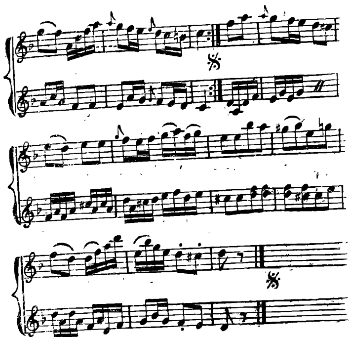
FIGURE , En avant deux , Chassez déchassez , Traversez Chassez déchassez , Balancez a vos Dames , Un tour de mains , Chaine des Dames entiere , Demie queue du chat , Demie chaine Anglaise ,