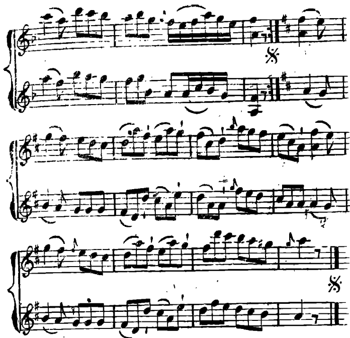
FIGURE , Chaîne Anglaise entière , En avant deux , Chassez déchassez , Traversez , Chassez déchassez , Balancez a vos Dames , Touc de mains , Figurez a droite , Chassez ouvert en avant huit , A vos places ,