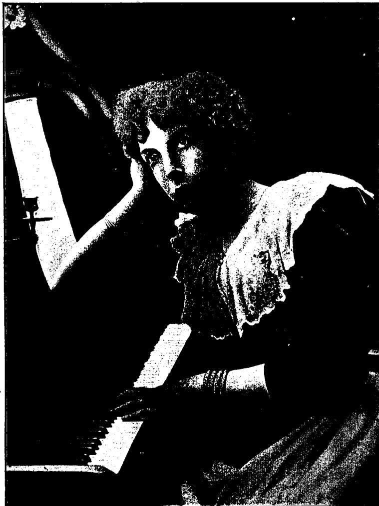
D'APRÈS UN PORTRAIT DE H.-S. MENDELSSOHN