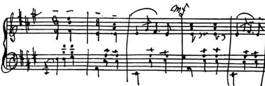
FROM THE ORIGINAL MANUSCRIPT OF EDUARD STRAUSS' "GREETING TO AMERICA"