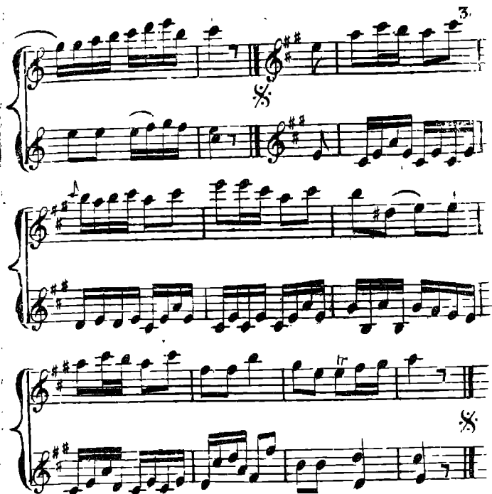
FIGURE , Chaine Anglaise entiere , Balancez à vos Dames , Un tour de mains , La chaine des Dames entiere , Demie queue du chat , Demie chaine Anglaise , Contre-partie pour les 4 autres ,