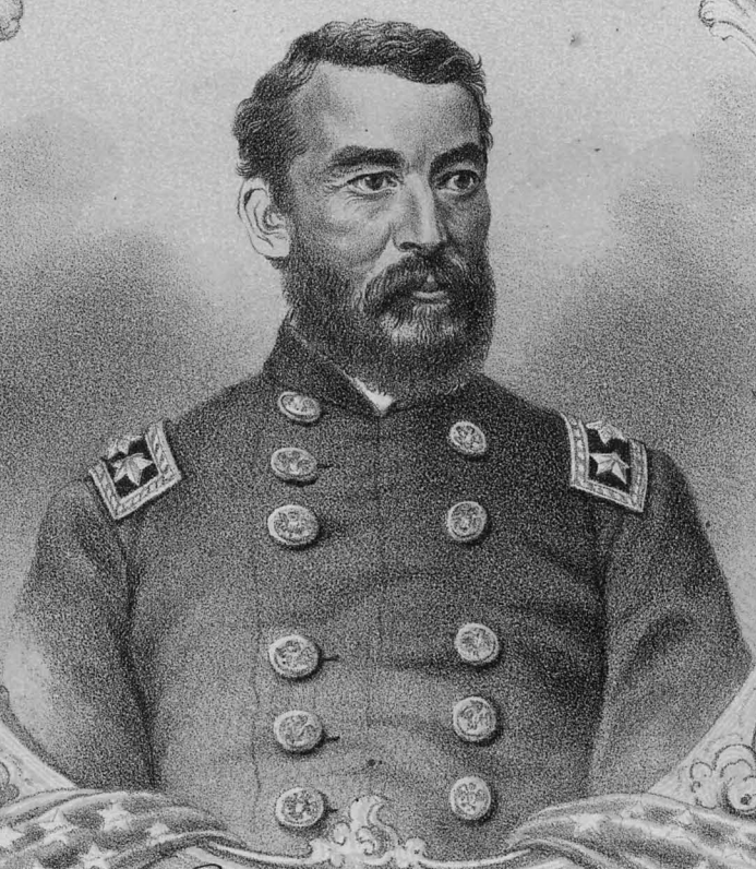
Phil H. Sheridan.