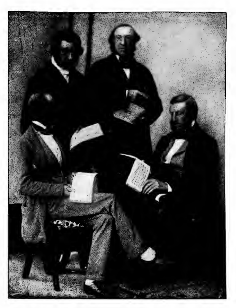
An Orpheus Quartet.