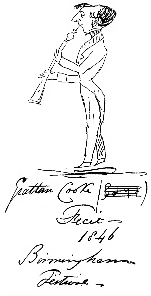
FROM A SKETCH (? OF MENDELSSOHN) BY GRATTAN COOKE. The notes are both the initials of the artist, and those of the boy's recitative, "There is nothing" (Elijah).