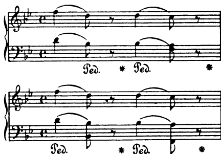
(Hier wechselt die linke Hand.)

Beispiele: (Nr. 1 ohne Verschiebung, Nr. 2 mit Verschiebung.)