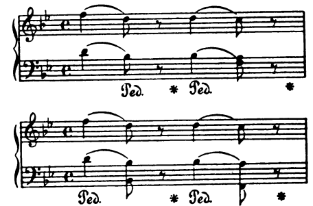
(Here the left hand shifts.)

Example: (Nr. 1 without the soft pedal, Nr. 2 with it.)