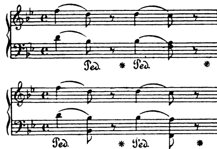
(Ici la main gauche change de registre.)

Lorsque la main se déplace dans une phrase très liée, la pédale peut également corriger le défaut qui en résulte. Exemples (No. 1 sans déplacement, No. 2 avec déplacement.)